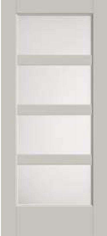
4 Lite Satin Etch Glass S5710XE Available in 8' S857210XE