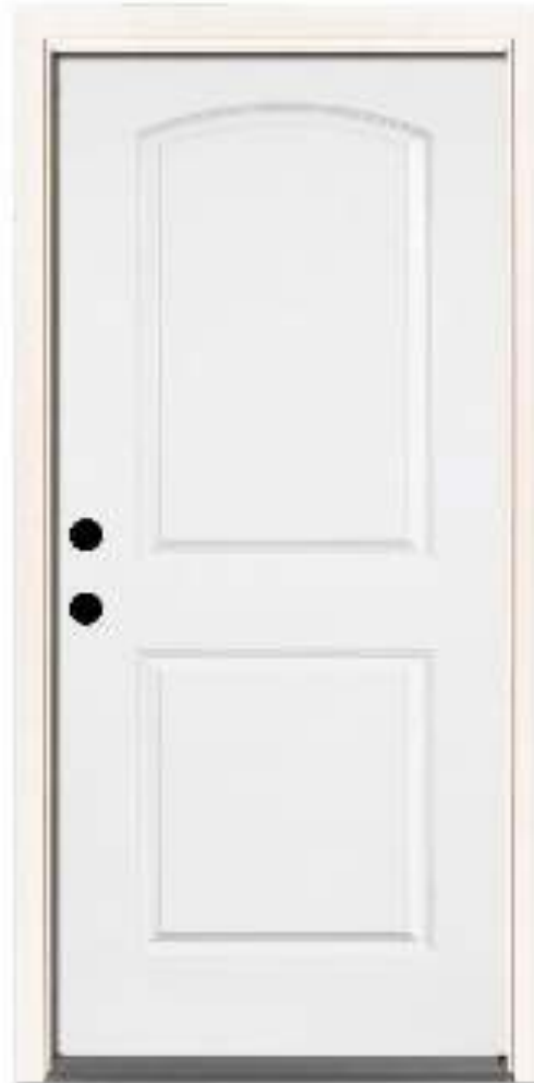
Raised 2 Panel Arch Top Rosario/Roman Available in 8' S897