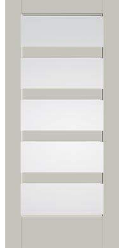
5 Lite Satin Etch Glass S5720-XE Available in 8' S85720XE