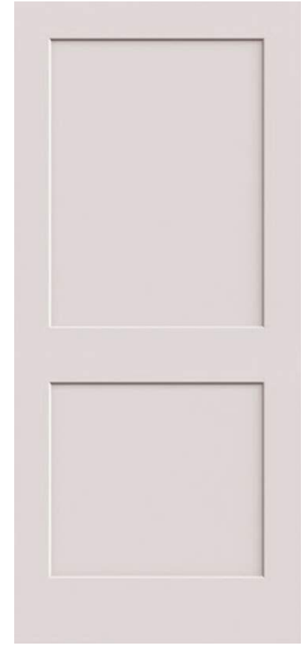
Whitman / Logan 2 Panel Recessed Flat Available in 8'