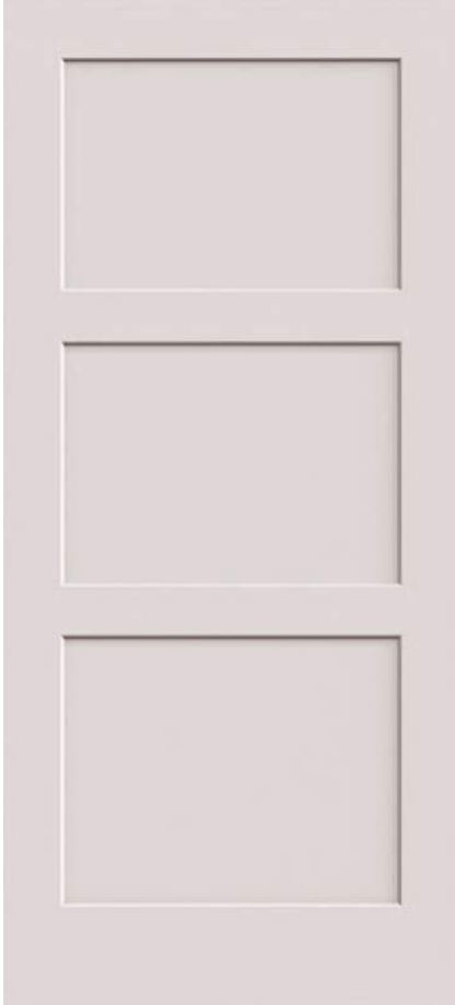
Aberdeen / Birkdale 3 Panel Recessed Flat Available in 8'