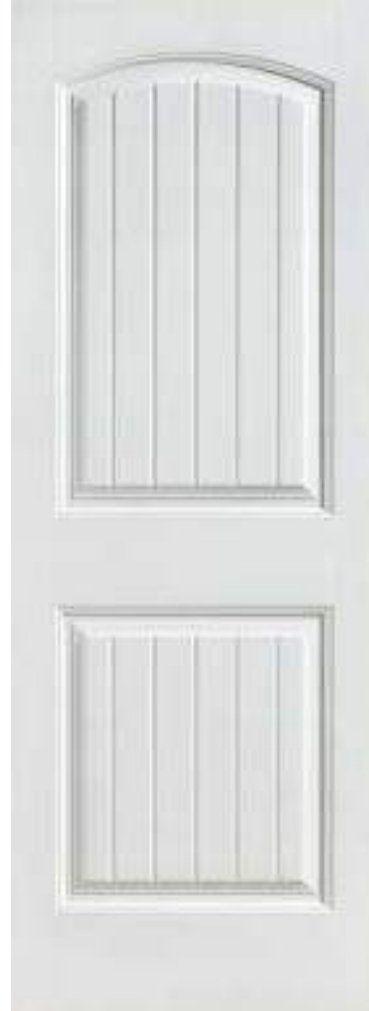
Santa Fe Arch Top / Cheyenne 2 Panel Arch w/ Grooves No 8' available