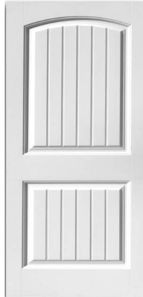
Santa Fe Raised 2 Panel Arch with Grooves No 8' Available