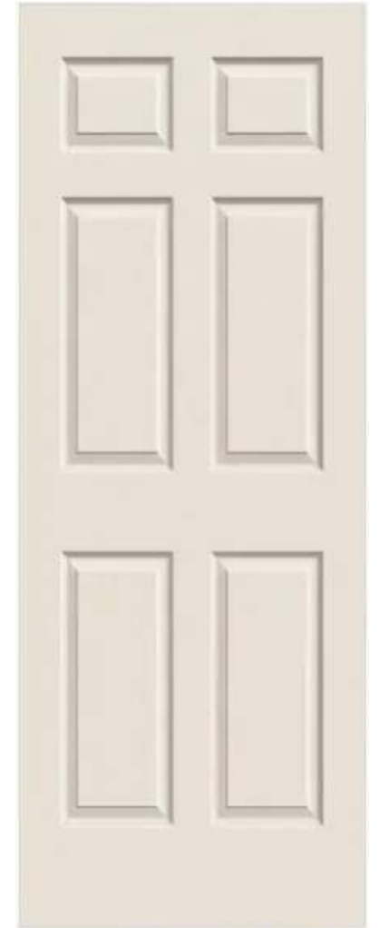
Raised 6 Panel Colonial Columbia/Coventry Available in 8'S810