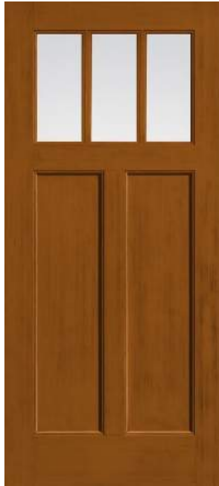
Craftsman Recessed 3 Panel 3 Lite CCA230 (Option) Available in 8' CCA8230