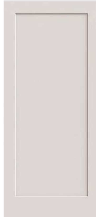
Mercer / Madison 1 Panel Recessed Flat Not Available in 8'