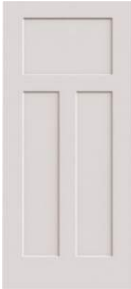
Recessed 3 Panel Craftsman Aberdeen/Birkdale Available in 8' S8400 Smooth Fiberglass