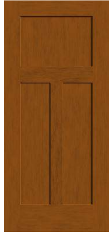
Craftsman Recessed 3 Panel CCA1125 Available in 8' CCA81125