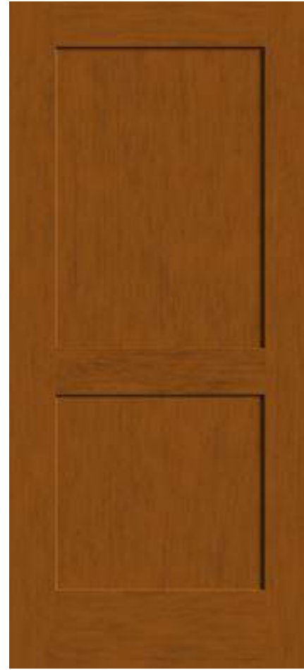
Recessed 2 Panel Square CCA1127 Available in 8' CCA81127