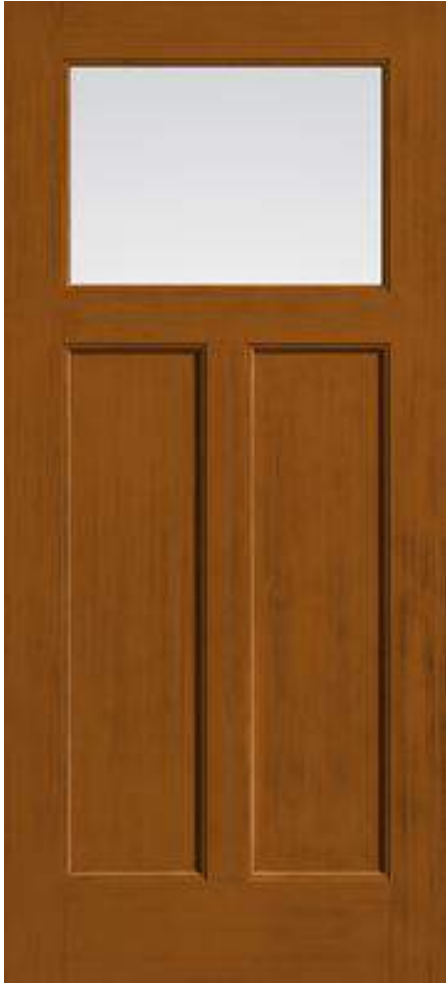
Craftsman Recessed 3 Panel 1 Lite CCA210 (Option) Available in 8' CCA8210