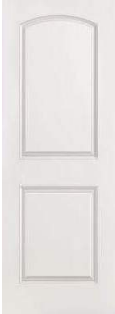
Rosario / Roman Raised 2 Panel Arch Top Interior 8' Available