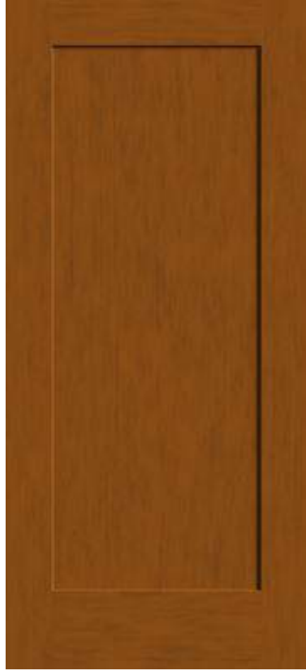
Recessed 1 Panel Square CCA1100 Available in 8' CCA81100