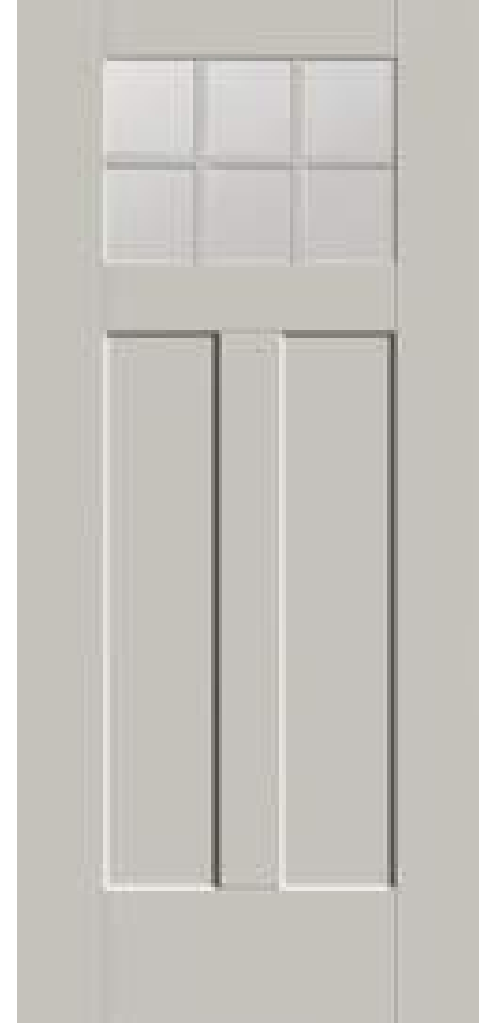
Craftsman 6 Lite with Clear Glass Option Available in 8' S84816