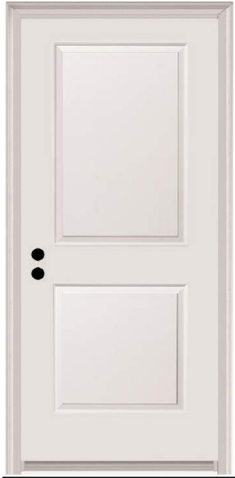
Raised 2 Panel Square Top Kingston/Carrera Available in 8' S8200