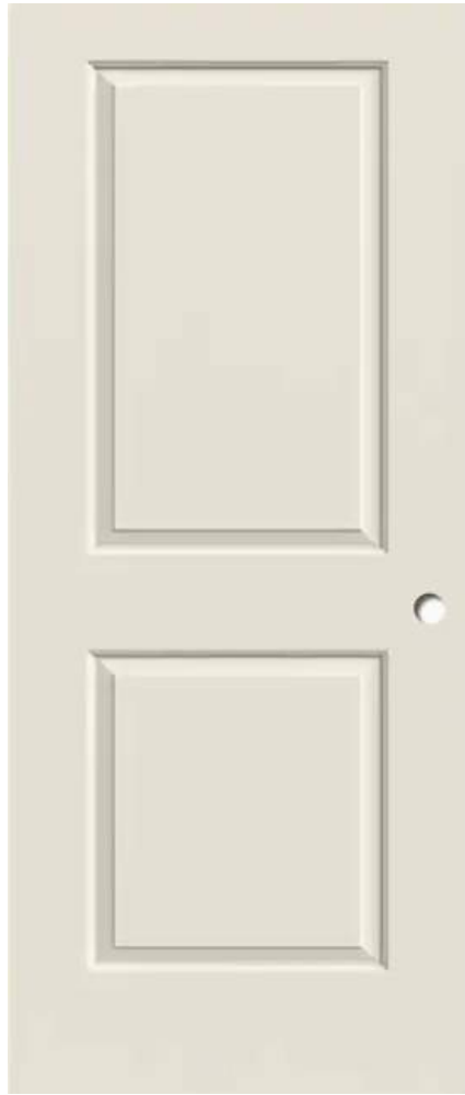
Recessed 2 Flat Panel Square Top Available in 8' S120 Whitman/Logan Smooth Fiberglass