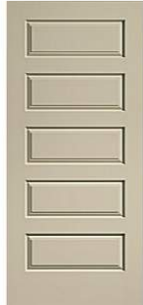
Raised 5 Panel Riverside CCV050 No 8' Available Textured Paint Grade