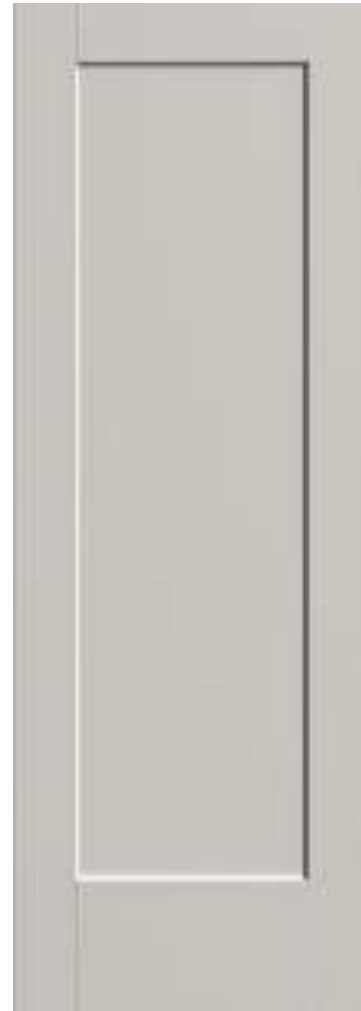
Recessed 1 Flat Panel Mercer/Madison Available in 8' S81100 Smooth Madison