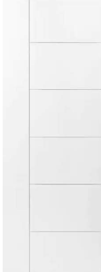
Masonite Berkley Flush w/ Grooves Not Available in 8'