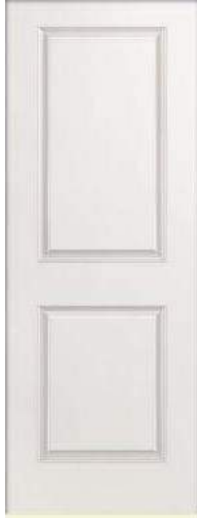
Kingston / Carrara Raised 2 Panel Square Top Interior 8' Available