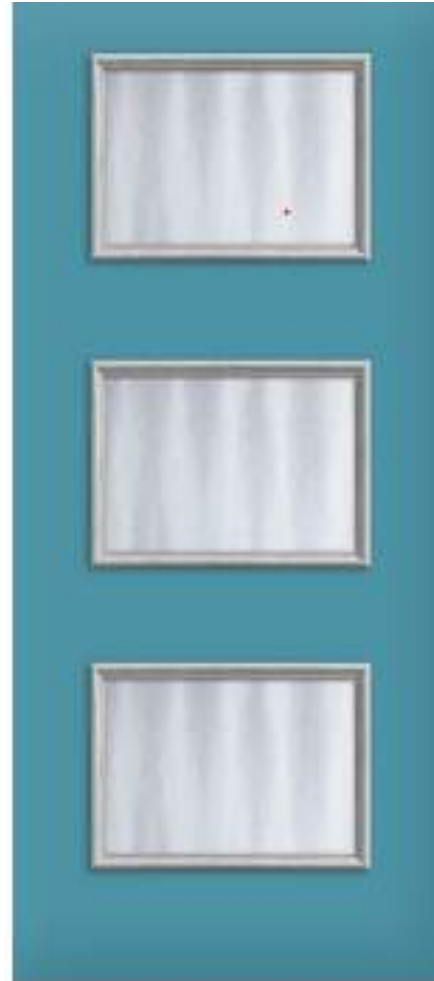
3 Square Satin Etch Glass Pulse S2XE Scrolled Profile Available in 8' S83XL 4 Lite