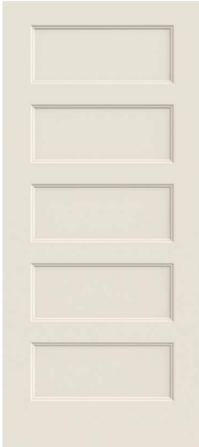
Winthrop / Conmoore 5 Panel Recessed Flat Not Available in 8'