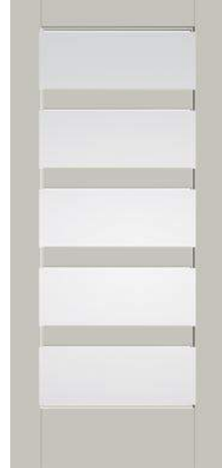
5 Lite Satin Etch Glass S5720-XE Available in 8' S85720XE