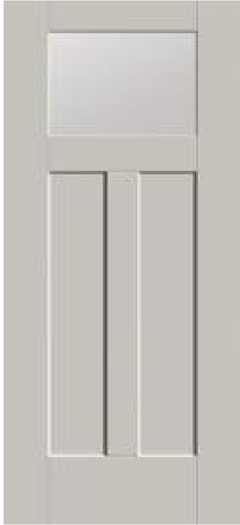
Single Lite with Clear Glass Option Available in 8' S84810