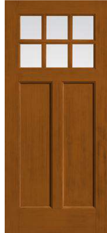
Craftsman Recessed 3 Panel 6 Lite CCS260 (Option) Available in 8' CCA8260