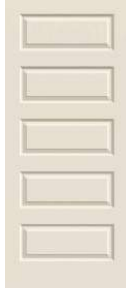
Riverside Raised 5 Panel Interior 8' Available ( 6 Panels for 8 foot tall )