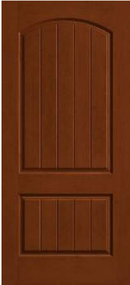
Santa Fe Raised 2 Panel Arch with Grooves CCR205SG Available in 8' CCR8205SG