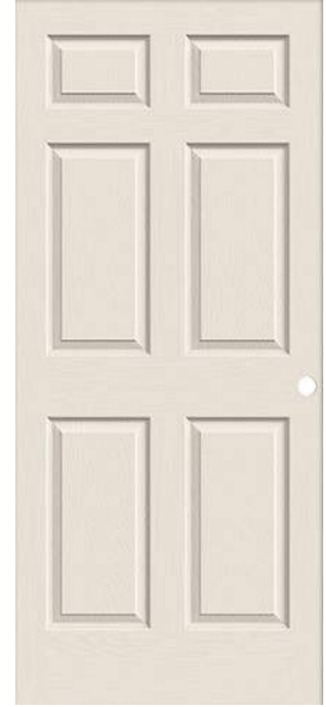
Level 2 Columbia / Coventry 6 Panel Colonial Interior 8' Available