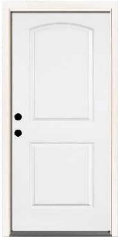
Raised 2 Panel Arch Top Rosario/Roman Available in 8' S897