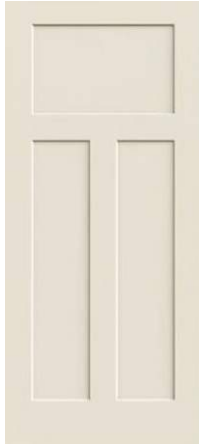
Yarrow / Winslow Craftsman Recesses Flat Not Available in 8'