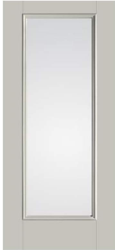
1 Panel Etch Glass S118 Available in 8'S8118