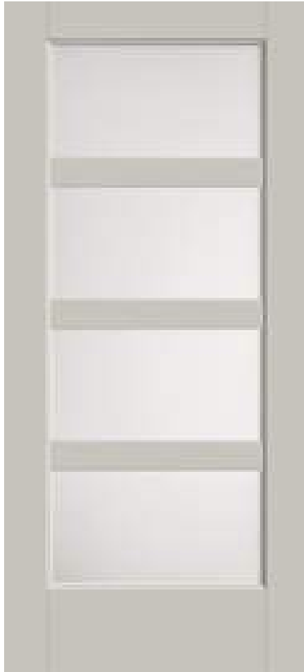
4 Lite Satin Etch Glass S5710XE Available in 8' S857210XE